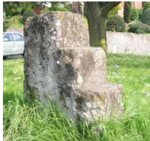
The stepped mounting block , salvaged from a local orchard, is typical of several erected in this area many years ago for horse riders.