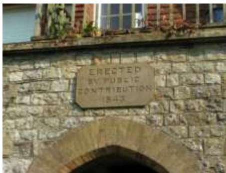
Loose's first village school

Finally, the 17th century Chequers Inn is ideally situated for rest and refreshment before the steep climb back to Loose Green.