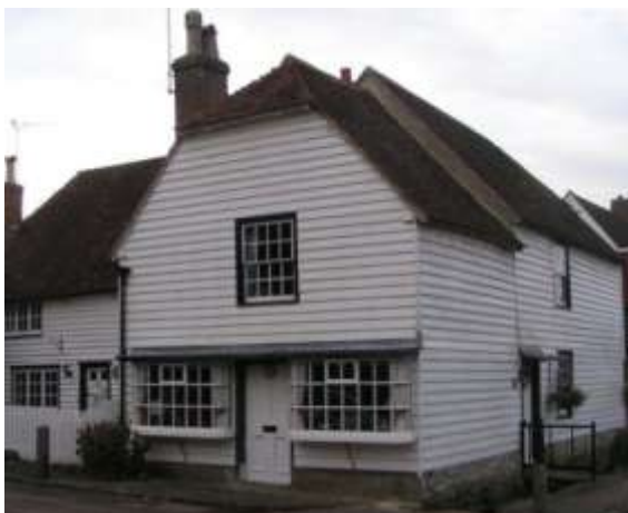
Florence House , on the corner of Bridge Street and Church Street, was once a shop.

Down in the garden on your right is The Dairy House , which has been a smithy, beerhouse and dairy in times past. At the end of Bridge Street the mill race cascades down to the site of the waterwheel that powered Village Mill. To the right of the cascade is Brooklyn, formerly the millers house ; to the left is Millbourne Cottage, previously the millers stables .