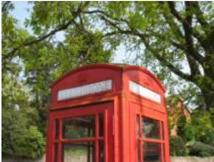
The telephone kiosk is a 'K6', a type introduced in 1936.

The slip-road shaded by the tree was part of a public transport terminus for trams from 1907 to 1930, trolleybuses (1930 – 1967) and motor buses until the 1990s.