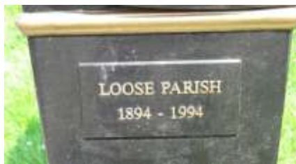
The litter bin and others like it in the village commemorate the centenary of Loose Parish Council.