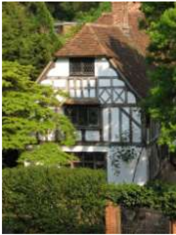
Olde Hill House

Walk back to Old Loose Hill and turn left, to pass two more fine timber-framed properties.